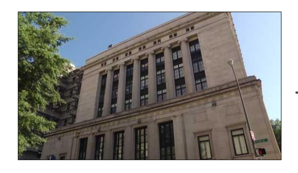
Virginia Criminal Sentencing Commission Study HB 1105